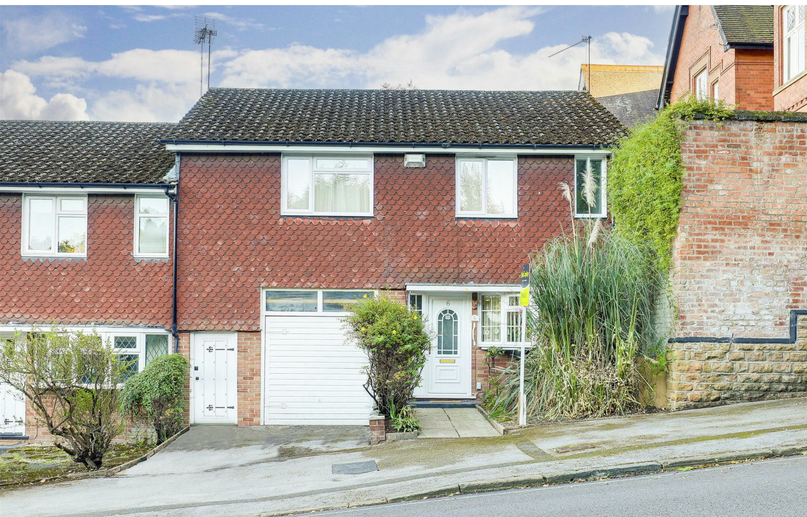
Cavendish Mews, The Park, Nottinghamshire NG7 1BY